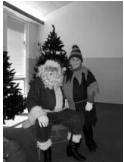
The guest of honor at the St. Anselm St. Nick's party with one of his elves.

The Christmas Manger: Our manger scene with live animals has been a favorite tradition each year at St. Anselm, especially with children, since 1985! This year, why not give your kids an opportunity to feel important by helping out? Sign up sheets will be in the lobby for volunteers to feed and clean the animals. Volunteers are needed twice a day (before 9 a.m. and before 6 p.m.) from about a week before Christmas, until they leave, usually about 10 days after Christmas. Even if you are not able to maintain the crèche, bring your